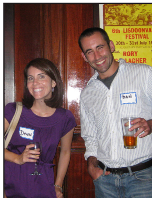
YPG members at a recent event.